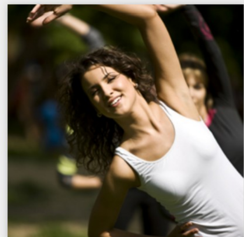
[VIRTUAL] Ai Chi Renewal Program fo...