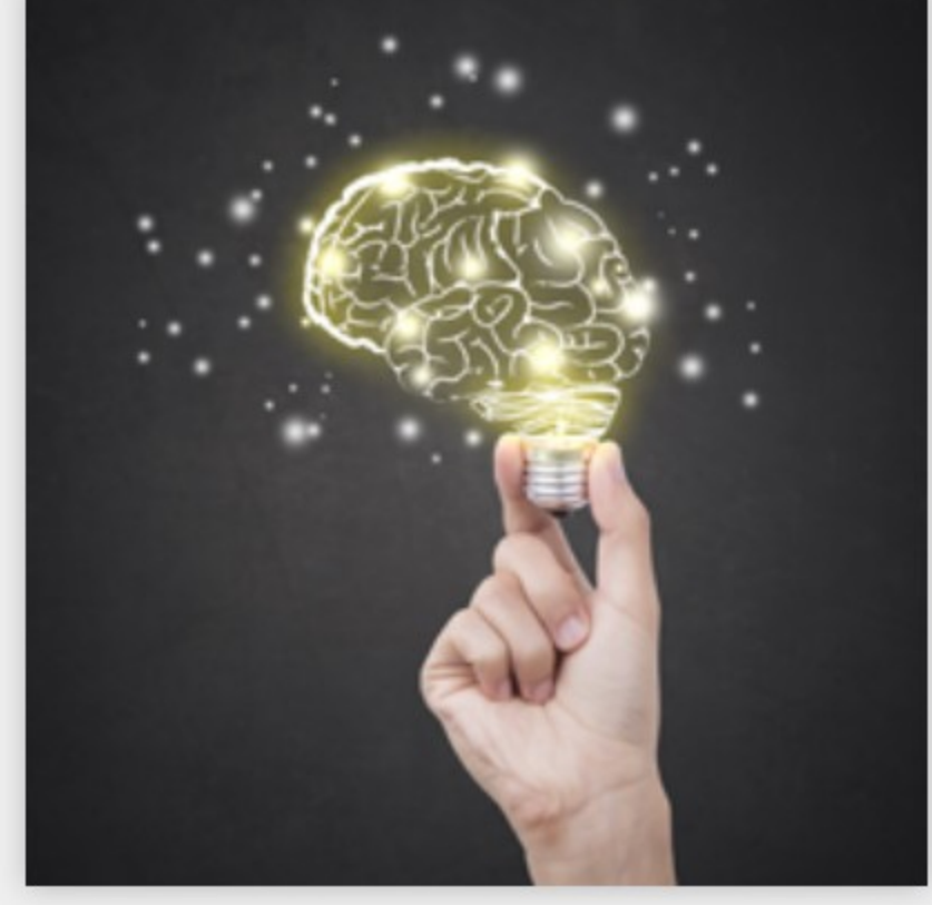
[VIRTUAL] Positive Neuroplasticity ...

Wed, Oct 26 - Wed, Dec 07 06:15 PM - 09:15 PM $90.00 MEMBERS / $90.00 PUBLIC